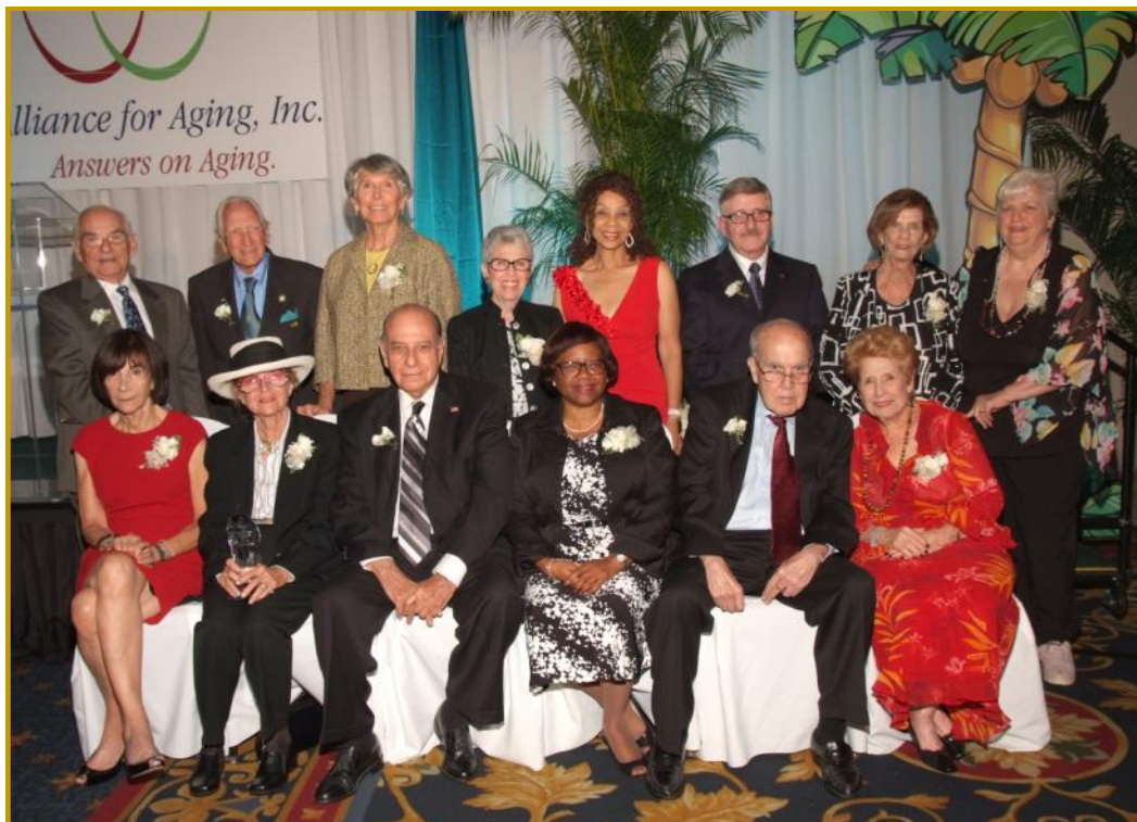
Positive Living Awards 2012 Honorees